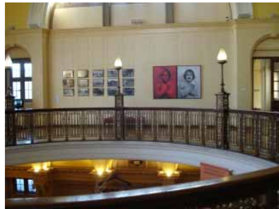
Corresponding artworks: Pictures and paintings by Harald Hauswald (top left), Sándor Pinczehelyi (top right) and Zbyněk Benýšek.

motivations of the rioters in order to expose the manipulative use of symbols of 1956 by contemporary media and politicians.