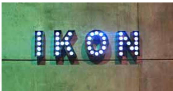
The Gallery for Contemporary Art in Birmingham.