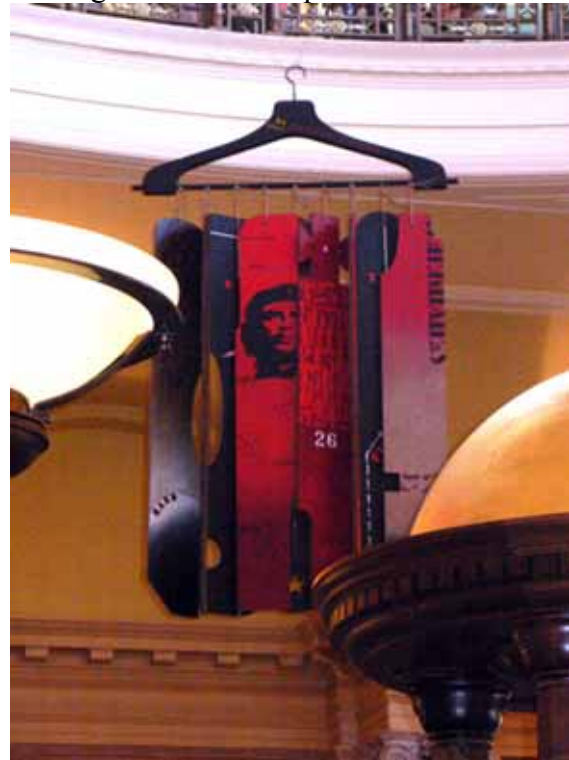
Hanging History – Stock of History by Silvestro Lodi.

freedom. His doings and whereabouts were no longer classified as political and he was