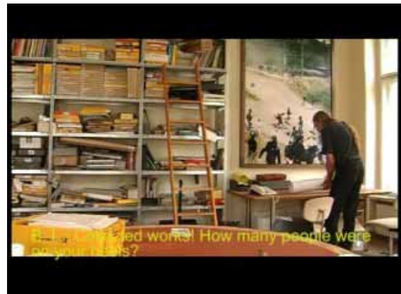
Scenes from the film documentary by Barbara Lubich.