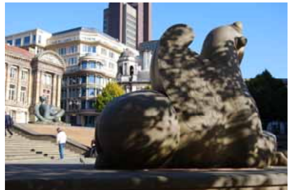
Birmingham - A city in love with sculpture and public art (Photos: Ulf Göpfert, Silvestro Lodi).