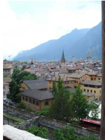
Taking a glance at the surroundings of impressive Castello del Buonconsiglio.

artistic act of lasting relevance. Willing to distinguish themselves from competitors, avant-garde and provocative artists run the risk of retrospectively portraying earlier contradictory (alienating) expressions of their fragmented identity as a whole in the context of their Self and their environment.