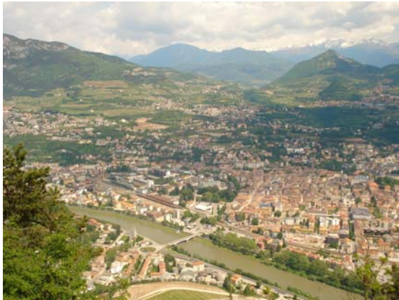
Bird's-eye view on Trent.

dissemination of information and the formation of political opinions are still possible, albeit by means of ciphered communication. Although – luckily – literature has lost this specific political function in contemporary European societies, there is no doubt that men and women of letters may still play a vital role in processing our shared past of dictatorships. “They are virtually predestined to refer our present to our past, to rally against forgetting in an era lived at an ever-increasing pace, and to cultivate the difficult art of remembrance. (...) Thus the sensitivity developed by the authors of the period both to the potential ideological contamination of all sections of society and, within that context, to the manipulative, but also the informative and liberating possibilities of their particular medium – the word – can still be seen as a basis for lasting relevance and impact.” 2