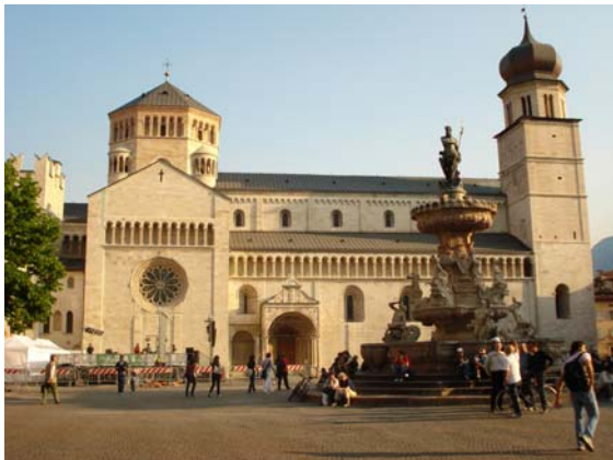
The Cathedral of Trent.

The contributions convened during the last 18 months for the volume Present tensions. European writers on overcoming dictatorships (Budapest: CEU Press, 2008) are not just creative products of the respective author, but results of the joint reflections during the project in its own right. Editors Kristina Kaiserová and Gert